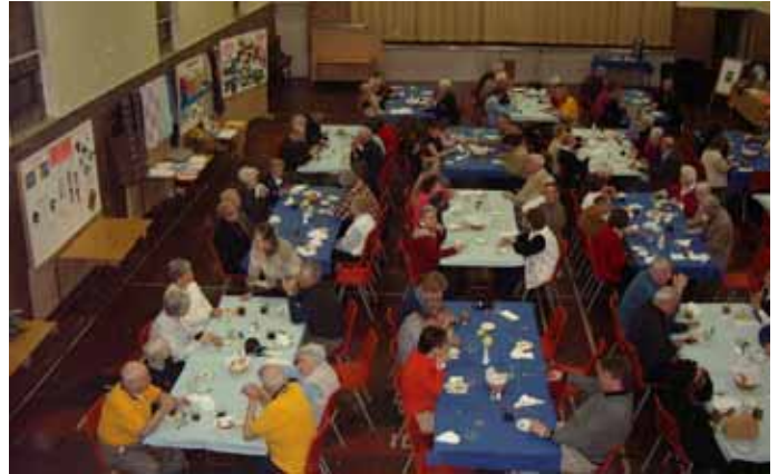
WE EAT AGAIN! O WHAT FELLOWSHIP!