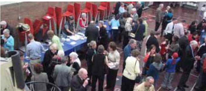
COFFEE AFTER VOLUNTEER COVENANTING SERVICE